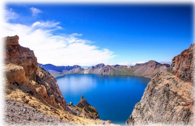
Changbai Mountain North Slope Scenic Area