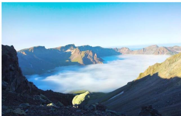
Changbai Mountain South Slope Scenic Area