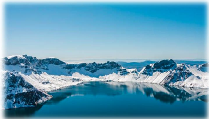
Heaven Lake on Changbai Mountain